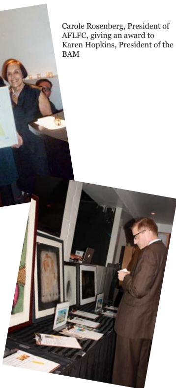
Browsing at the Silent Auction