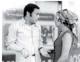
De cierta manera / One Way or Another Sara Gómez, Cuba, 1974

HFFNY celebrated Cuba's remarkable film history with New Cuban Cinema: 55 Years of a Shared Dream , a program featuring 14 works spanning over five decades of production by the renown ICAIC (Cuba's National Film Institute). Curated by film critic and director of Cinemateca de Cuba Luciano Castillo, this special sidebar presented a wide panorama of film production in the island through emblematic works little known in the U.S., some of which were subtitled and restored to near mint-condition especially for this occasion.