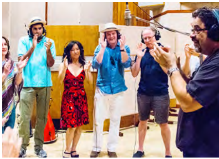
Travelers participate in studio recording with Arturo O'Farrill during our latest cultural exchange trip to Havana