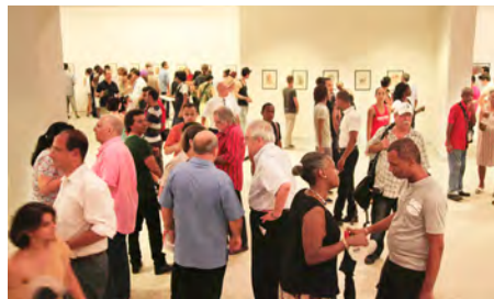
Dalí exhibition at National Museum of Fine Arts, Havana