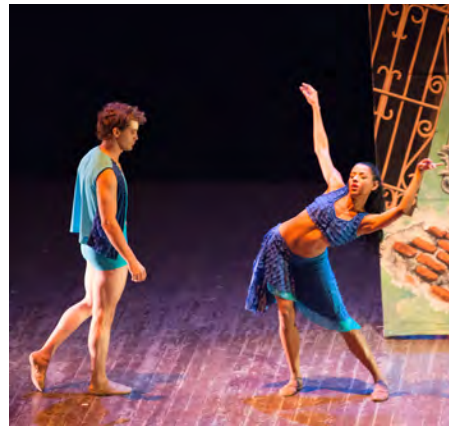
Endedans performs Moments in the Wind in Camaguey, Cuba