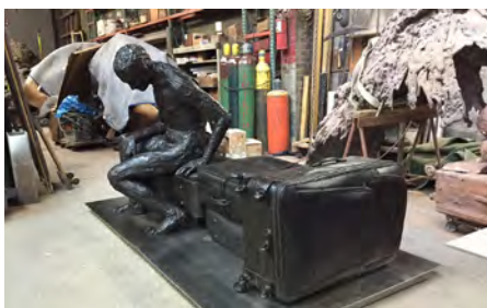
Yohan Capote sculpture at Modern Foundry in Queens