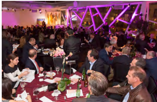
The Copacabana was packed with excitement