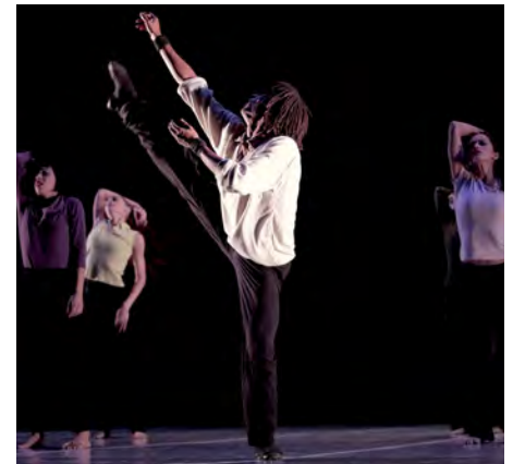
Malpaso's New York debut at The Joyce Theater in New York